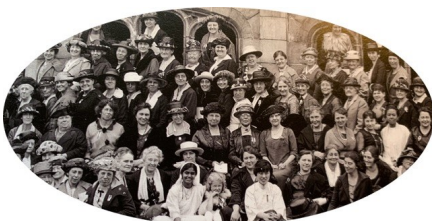
Women's Mission Society 1921

At the request of a number of people, the Small Groups Ministry is starting a new Women's Group - hoping to find a time that will allow for good intergenerational fellowship. Think Women's Retreat-Mini. Women of all ages are cordially invited to come together on Sunday February 25th from 12:30-1:30pm in Peacemaker's Room (1st floor of the church, past the office) or on Zoom to discuss what this group might entail, what it should be called, and when it should happen. Please come make your voice heard (if you have input but cannot attend, email your thoughts to smallgroups@seattlefirstbaptist.org ).